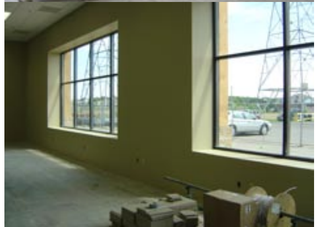
Photos of the new showroom, in progress, taken in early July. Top: The outside of the new showroom. Middle: Taken from the showfloor looking at the delivery area and community room. Bottom: Large windows in the showroom. Left: Map of the newly expanded dealership.

Last Summer Car Shows! Corvette Show: August 19th & Buick Show: September 16th