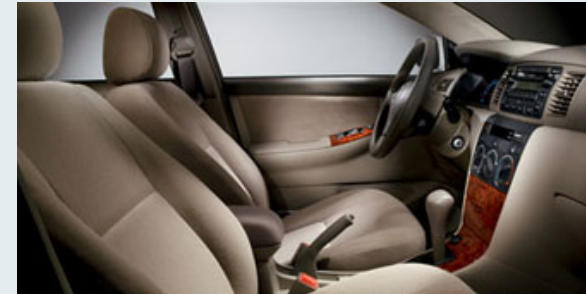
LE interior shown in Pebble Beige with available JBL® Value Package