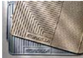
All Weather Mats $99.00 Parts Only MSRP**