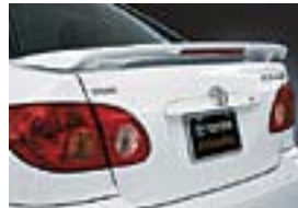
Rear Spoiler $425.00 Installed MSRP*