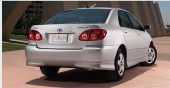
S shown in Silver Streak Mica