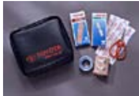
First Aid Kit $29.00 Installed MSRP*