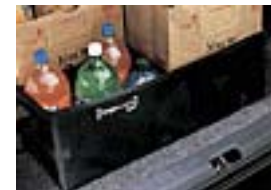
Cargo Tote $40.00 Installed MSRP*