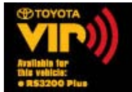
VIP Security System RS3200 Plus $359.00 Installed MSRP*