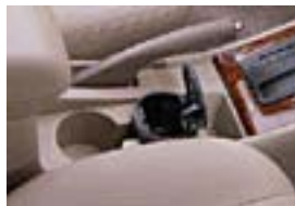
Ashtray Cup $18.00 Parts Only MSRP**