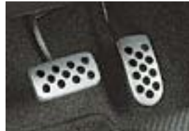
Sport Pedal Covers by OBX Racing Sports Silver Finish $79.00 Installed MSRP*

These interior accessories are also available: • Molded Dash Applique, Simulated Blackwood Dash