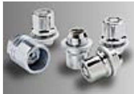
Alloy Wheel Locks $65.00 Installed MSRP*