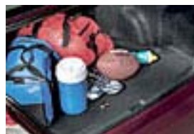
Xtreme Cargo Mat $79.00 Parts Only MSRP**