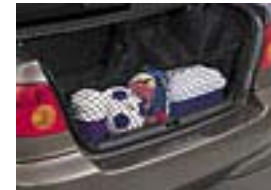
Cargo Net $49.00 Installed MSRP*