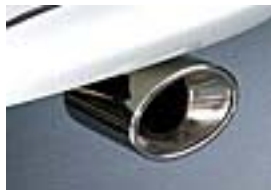
Exhaust Tip by Valor Manufacturing $64.00 Installed MSRP*