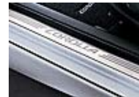
Door Sill Enhancements $159.00 Installed MSRP*