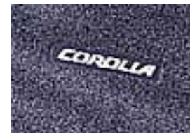
Carpet Floor Mats (4pc. set) $90.00 Installed MSRP*