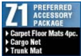
Preferred Accessory Package $220.00 Installed MSRP*