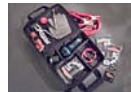
Emergency Assistance Kit $70.00 Installed MSRP*