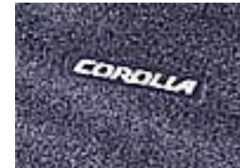
Carpet Floor Mats/ Cargo Mat Set (5pc. set) $171.00 Installed MSRP*