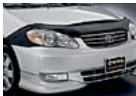
Front End Mask $88.00 Parts Only MSRP**