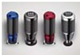
Shifter Knobs by OBX Racing Chrome or Titanium $49.00 Installed MSRP* Blue or Red $42.00 Parts Only MSRP**