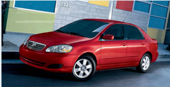
LE shown in Impulse Red with available 15-in. alloy wheels