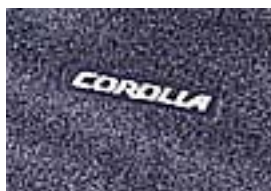
Cargo Mat $81.00 Installed MSRP*